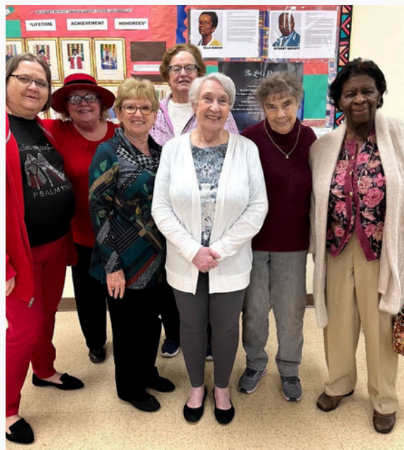
OUR EASTER "REASON TO CELEBRATE " PROGRAM DAY